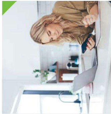
New Zealand Residential Property Sale and Purchase Agreement Guide

For more information on home buying and selling, visit settled.govt.nz or email info@settled.govt.nz