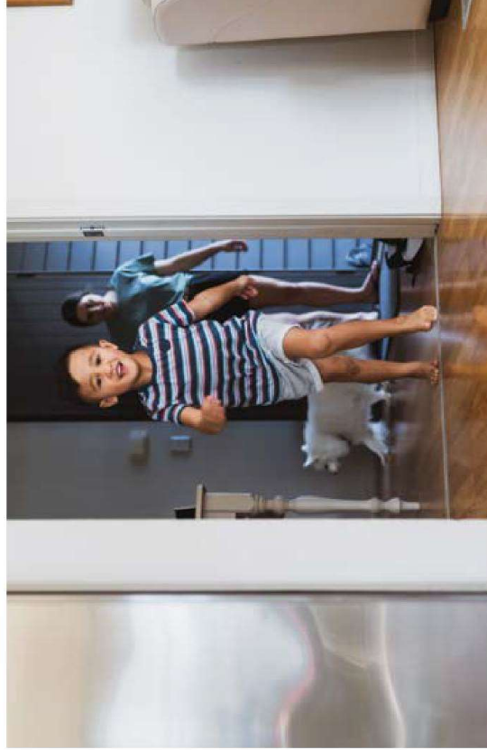
New Zealand Residential Property Sale and Purchase Agreement Guide

It is recommended that you seek legal advice if you are buying a property that is currently tenanted.