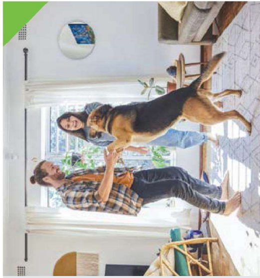
Approved under section 153 of the Real Estate Agents Act 2008. Effective from 14 October 2022.